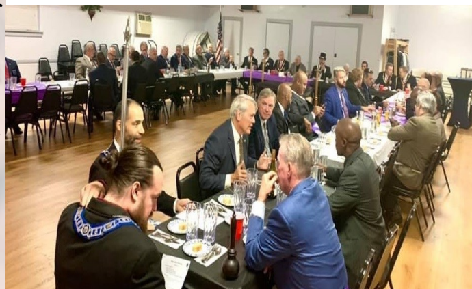
Table Lodge 2021 was an excellent evening of Brotherhood. A superior Nutley #25 tradition continues.